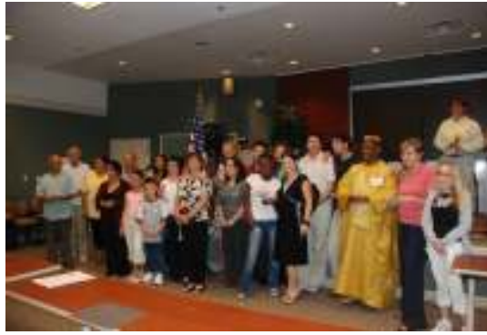
FCST clients and staff who recently received their U.S. citizenship. Approximately 50 clients in the program have become citizens within the past 2 years.

"A New Home: A New Life" honored all clients and staff who have recently become U.S. Citizens. FCST also applauded a provider of the year, and presented the 1st Annual Sunshine Award, which recognizes an outstanding refugee family in the FCST program. With almost 200 guests, it was an incredible event celebrating incredible people!