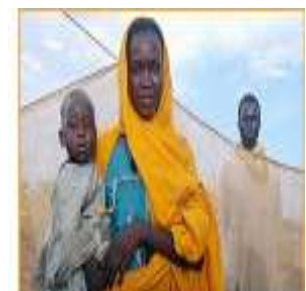
Burmese refugees of the Chin ethnic minority.

http://www.refugeesinternational.org/content/country/detail/2922/