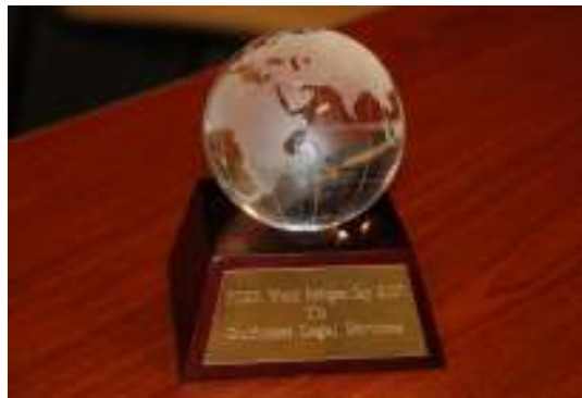
Gulf Coast Legal Services received the provider of the year award for their outstanding services provided to asylees and refugees in the FCST program.