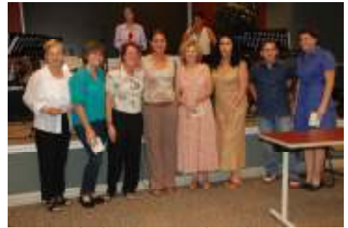
A group of volunteers pause for a photo opp. FCST volunteers have donated over 2000 hours of service during the past year.